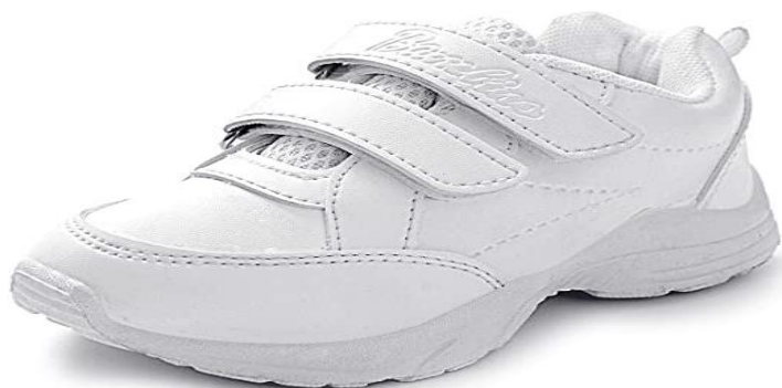
Shoes with VELCRO – BOY'S & GIRL'S for Primary