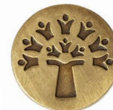
METAL BADGE FOR BLAZER