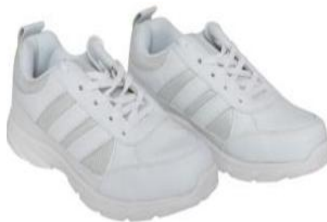
Shoes with LACE– BOY'S & GIRL'S for Secondary