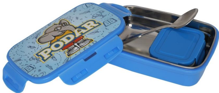
LUNCHBOX- COMMON-PIS/PREP- INSIDE STEEL