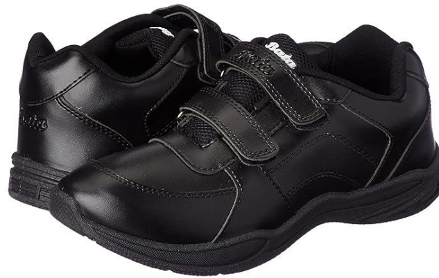
REGULAR BOY'S & GIRL'S BATA GOLATECH VELCRO SHOES