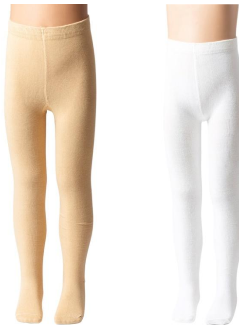
STOCKINGS – GIRLS – PIS SHADE – Beige and White