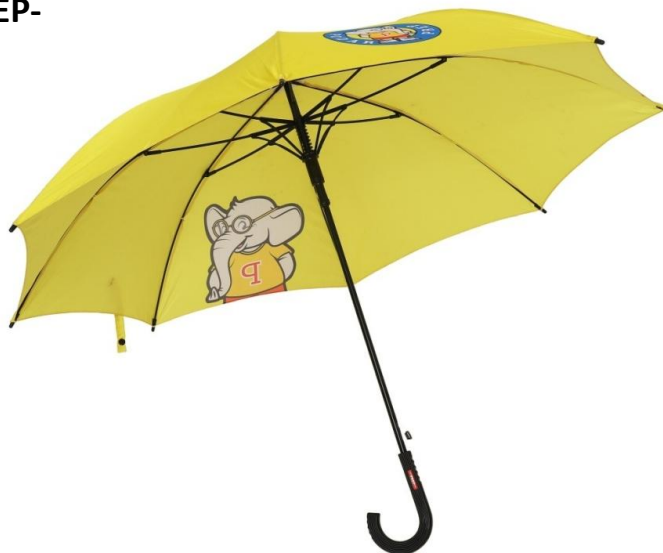
PREP UMBRELLA- PREPRIMARY AND PIS- PRIMARY