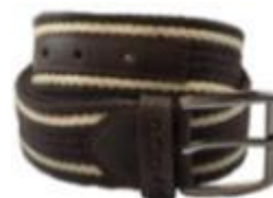
BELT- Canvas BOY'S/GIRL'S -PIS