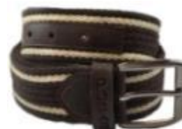
BELT- Canvas BOY'S/GIRL'S -PIS