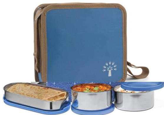
LUNCHBOX- COMMON-PIS/PREP- 3 STEEL CONTAINER INSIDE