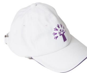
CAP-White-PIS- Two Sizes

Size – 6/8/10/12/20/22- Please go for Aqua Polo