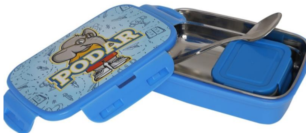
LUNCHBOX- COMMON-PIS/PREP- ALL STEEL