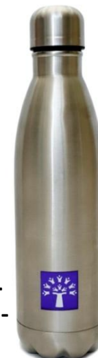
WATER BOTTLE COMMON- STEEL INSIDE/OUTSIDE - PIS/PREP