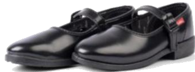
REGULAR GIRL'S SHOES WITH VELCRO