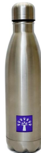
WATER BOTTLE COMMON - STEEL INSIDE / OUTSIDE – PIS/ PREP