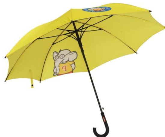
PREP UMBRELLA- PREP AND PIS- PRIMARY