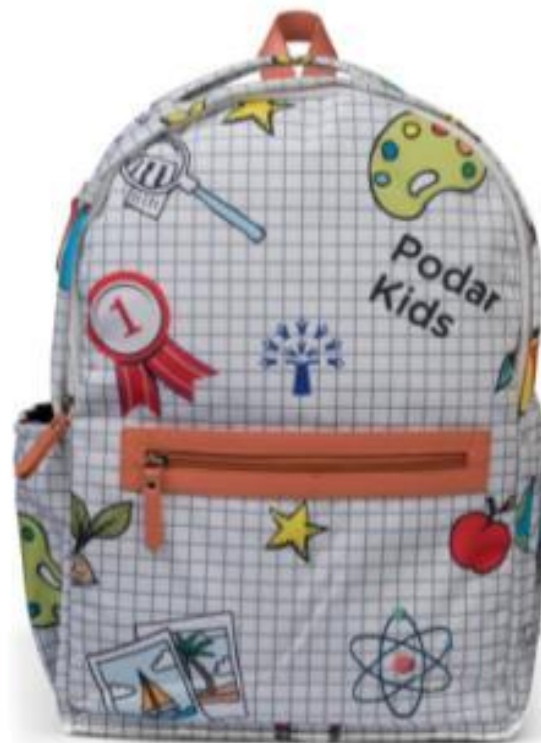
BAG – WHITE-PIS SIZES – SMALL, BIG