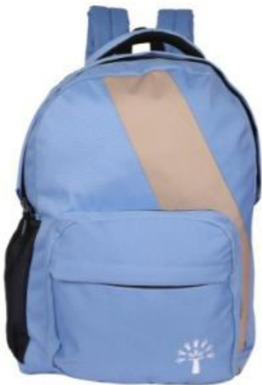
BAG – BLUE-PIS SIZES – SMALL, BIG