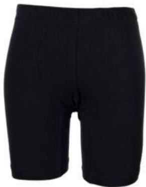
INNER SHORTS – GIRLS – PIS – SHADE – Navy