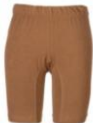
INNER SHORTS- GIRLS-PIS- DK Beige