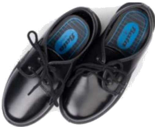
REGULAR BOY'S SHOES WITH LACE