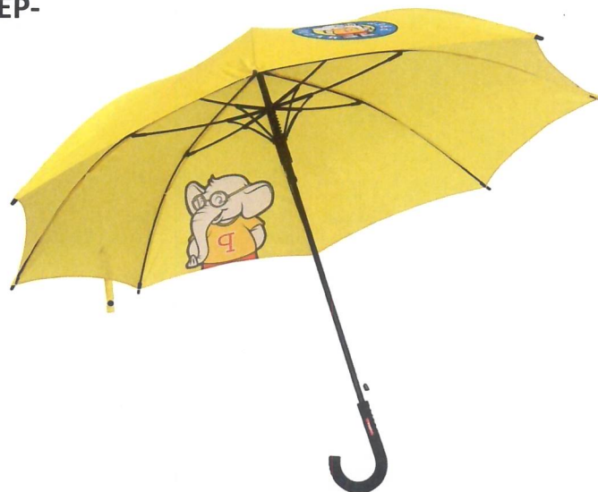
PREP UMBRELLA- PREPRIMARY AND PIS- PRIMARY