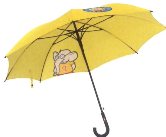
PREP UMBRELLA- PREP AND PIS- PRIMARY