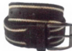
BELT- Canvas BOY'S/GIRL'S -PIS