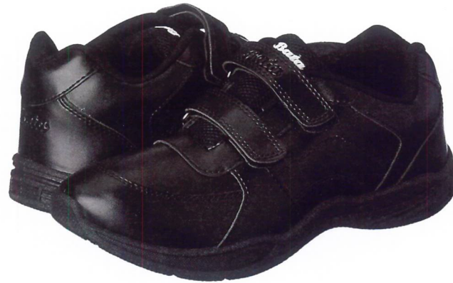
REGULAR BOY'S & GIRL'S BATA GOLATECH VELCRO SHOES