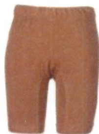
INNER SHORTS- GIRLS-PIS- DK Beige