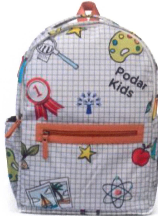
BAG – WHITE-PIS SIZES – SMALL, BIG