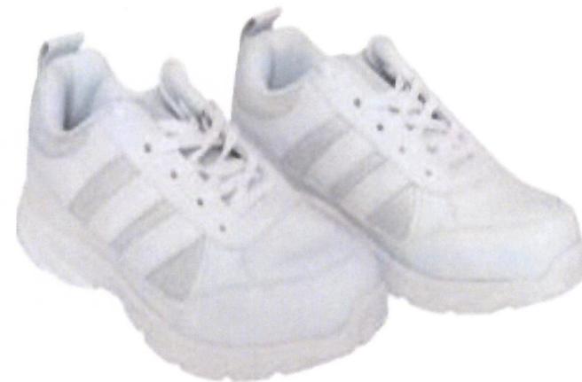
Shoes with LACE– BOY'S & GIRL'S for Secondary