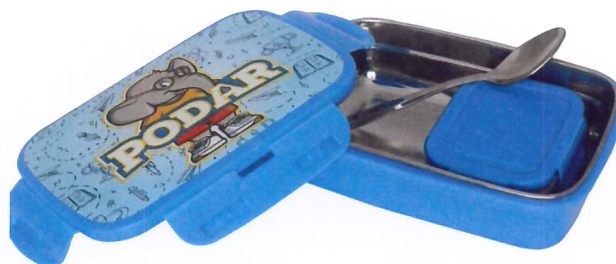
LUNCHBOX- COMMON-PIS/PREP- ALL STEEL