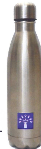
WATER BOTTLE COMMON- STEEL INSIDE/OUTSIDE - PIS/PREP