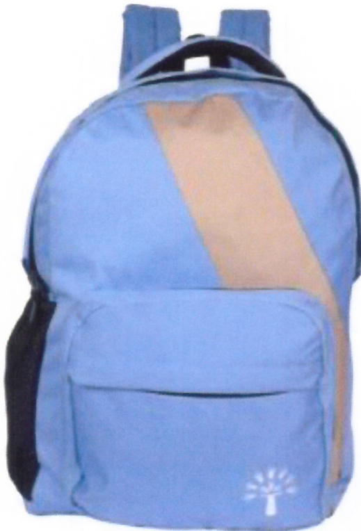
BAG – BLUE-PIS SIZES – SMALL, BIG