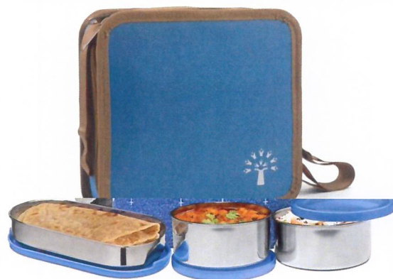
LUNCHBOX- COMMON-PIS/PREP- 3 STEEL CONTAINER INSIDE