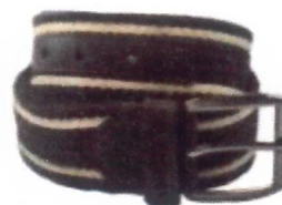
BELT- Canvas BOY'S/GIRL'S -PIS