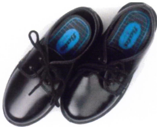
REGULAR BOY'S SHOES WITH LACE