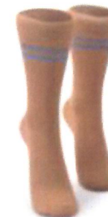
SOCKS- BOY'S/GIRL'S -PIS