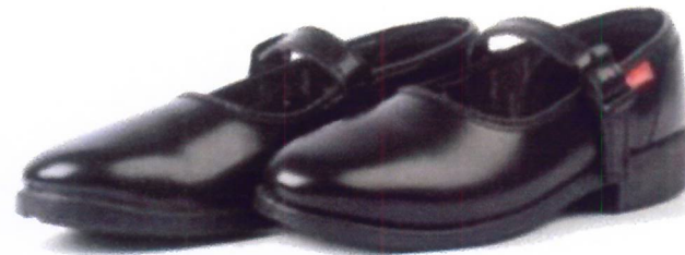
REGULAR GIRL'S SHOES WITH VELCRO