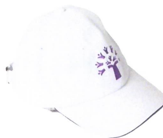
CAP - White-PIS - Two Sizes