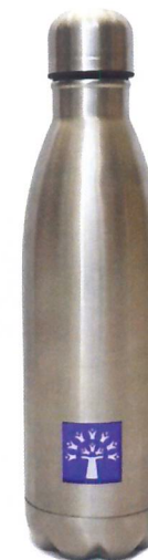
WATER BOTTLE COMMON - STEEL INSIDE / OUTSIDE – PIS/ PREP