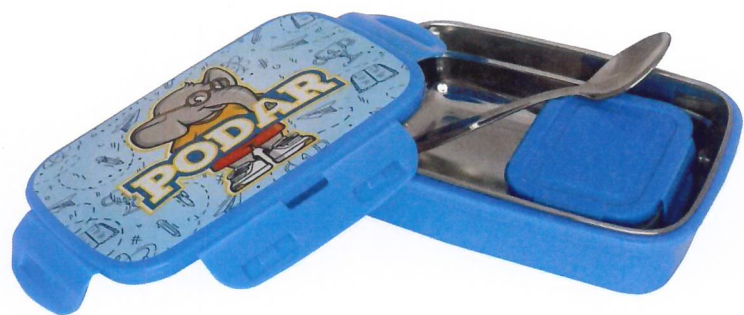
LUNCHBOX- COMMON-PIS/PREP- INSIDE STEEL