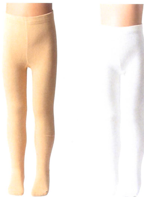
STOCKINGS – GIRLS – PIS SHADE – Beige and White