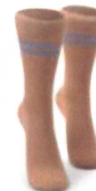
SOCKS- BOY'S/GIRL'S -PIS