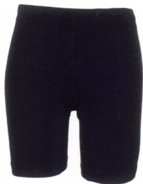
INNER SHORTS – GIRLS – PIS – SHADE – Navy