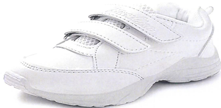
Shoes with VELCRO – BOY'S & GIRL'S for Primary