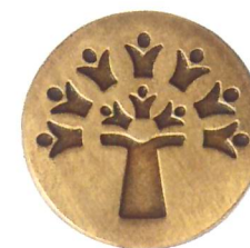
METAL BADGE FOR BLAZER