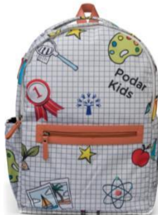
BAG – WHITE-PIS SIZES – SMALL, BIG