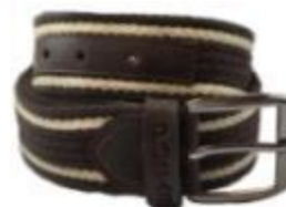
BELT- Canvas BOY'S/GIRL'S -PIS