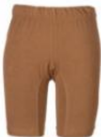
INNER SHORTS- GIRLS-PIS- DK Beige