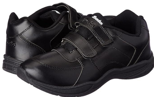
REGULAR BOY'S & GIRL'S BATA GOLATECH VELCRO SHOES