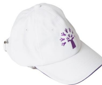
CAP - White-PIS - Two Sizes

STYLE :-BOYS + GIRLS PT POLO T SHIRT WITH PODAR TREE LOGO COLOR :- AQUA (BOYS + GIRLS) FABRIC :- :- 52% COTTON / 48% POLY - PIQUE SIZE :- 4 – 22