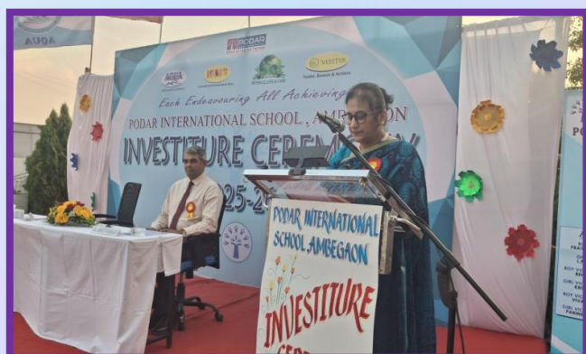
Speech by Principal Ma'am