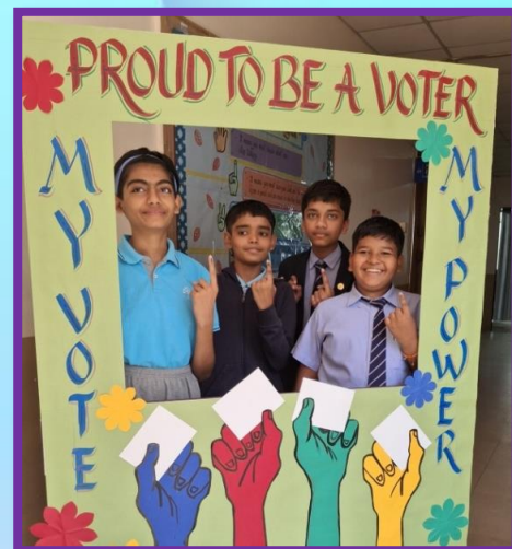
Voting by students