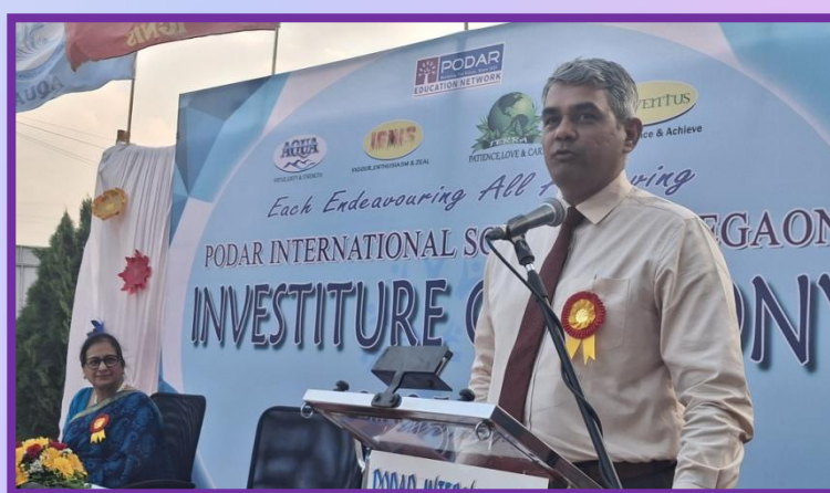
Speech by Chief Guest