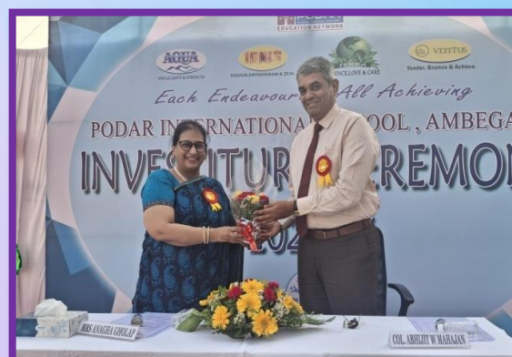
Chief Guest Felicitation