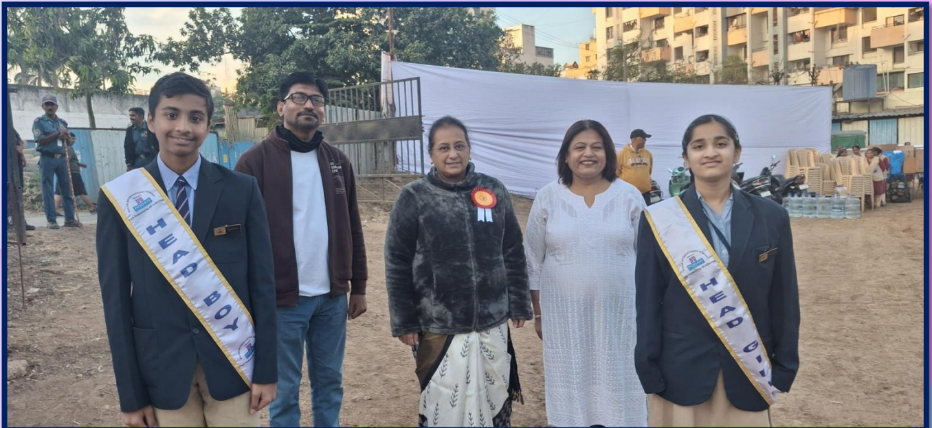
Escorting the Chief Guest