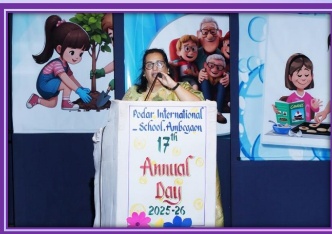
Speech by Principal Madam