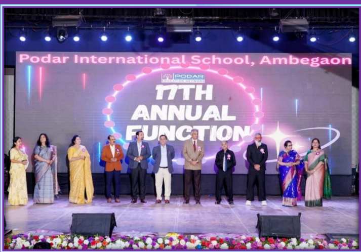
Felicitation of Chief Guests and Guests