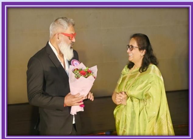
Felicitation of Chief Guest