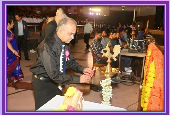
Sarswati puja and lightening of lamp