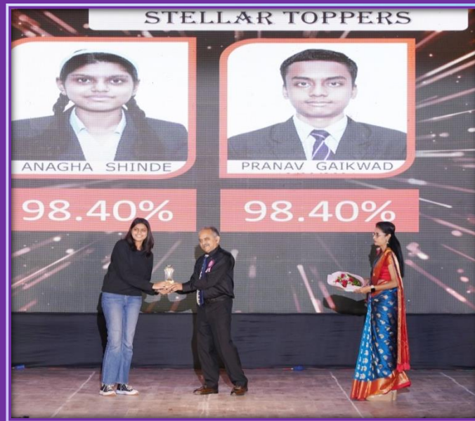
Felicitation of Std X Toppers